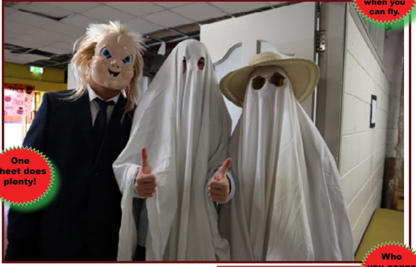
One sheet does plenty!