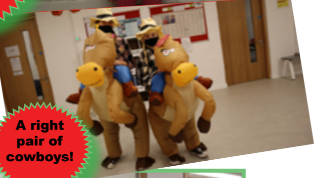
A right pair of cowboys!