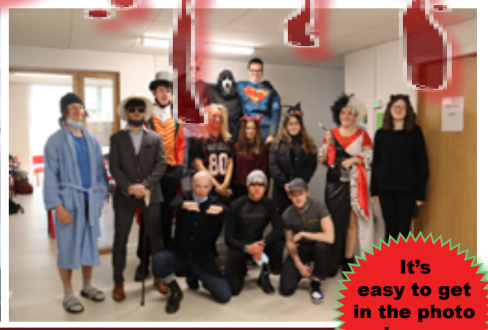
It's easy to get in the photo when you can fly.