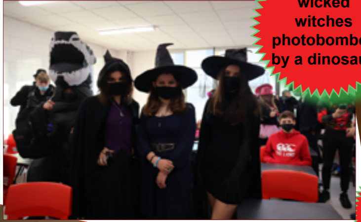
Three wicked witches photobombed by a dinosaur.