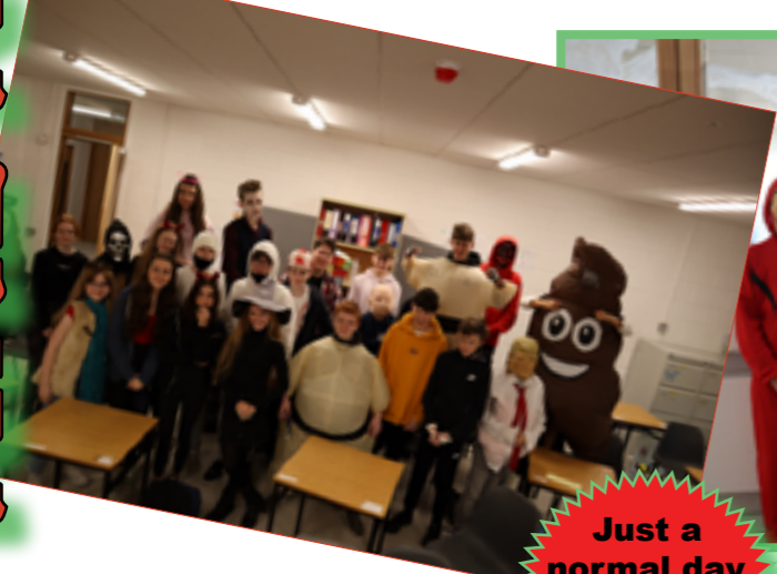
Just a normal day in this base class.